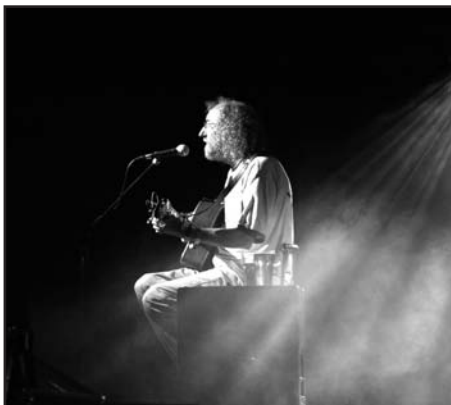
"Audiences remain faithful to this unique performer who can sting consciences with his songs one minute, and undermine bladder control with his lunatic mirth, the next." - The Living Tradition