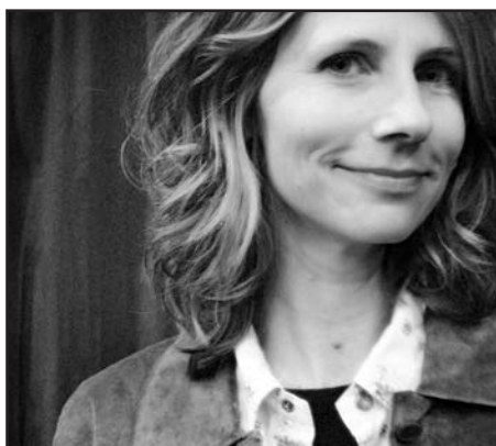
"Tracy Grammer is a brilliant artist and unique individual. Her voice is distinctive, as is her mastery over the instruments she plays." - Joan Baez